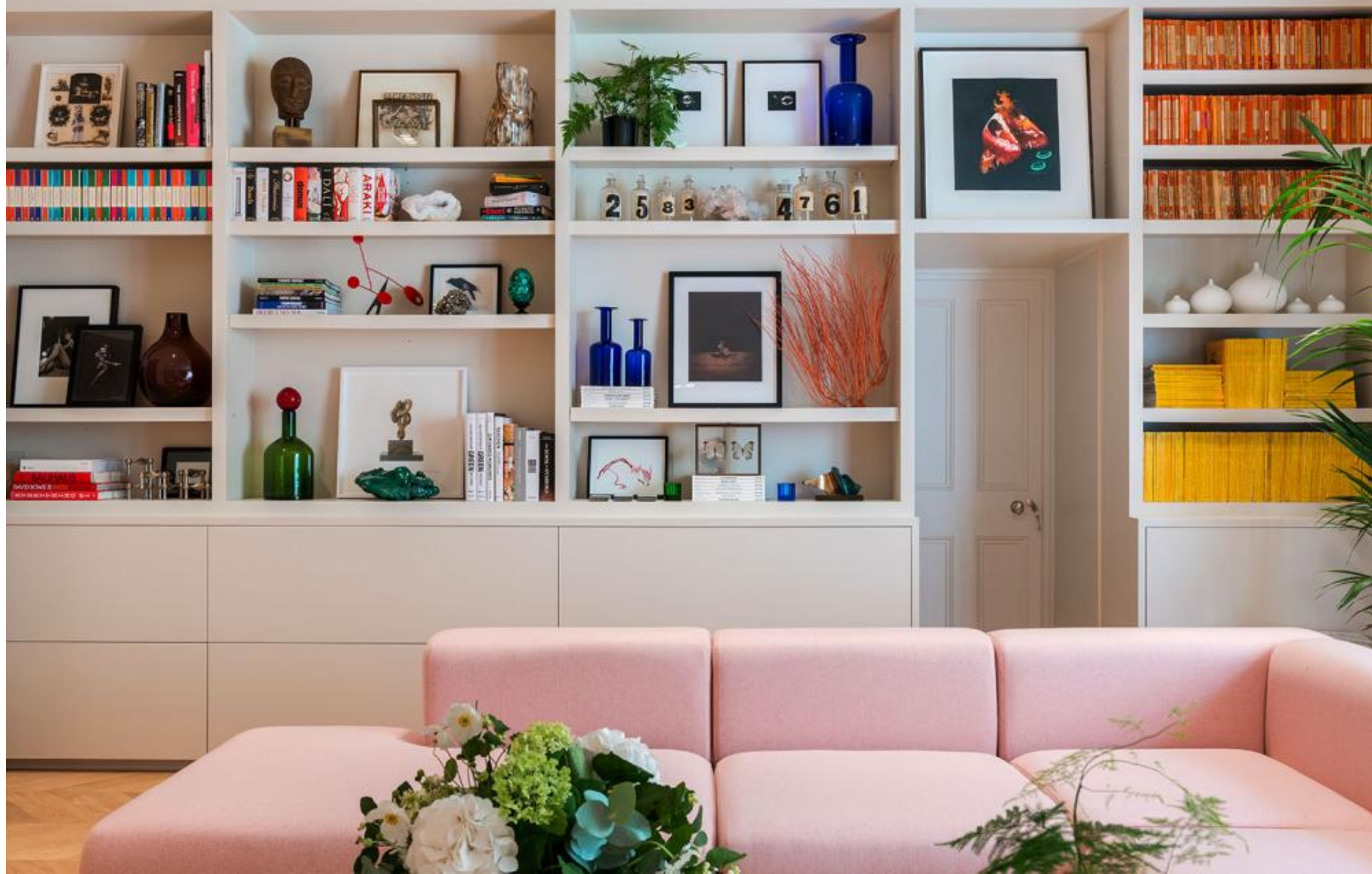
The interiors are contemporary and filled with prints, plants and sculptures