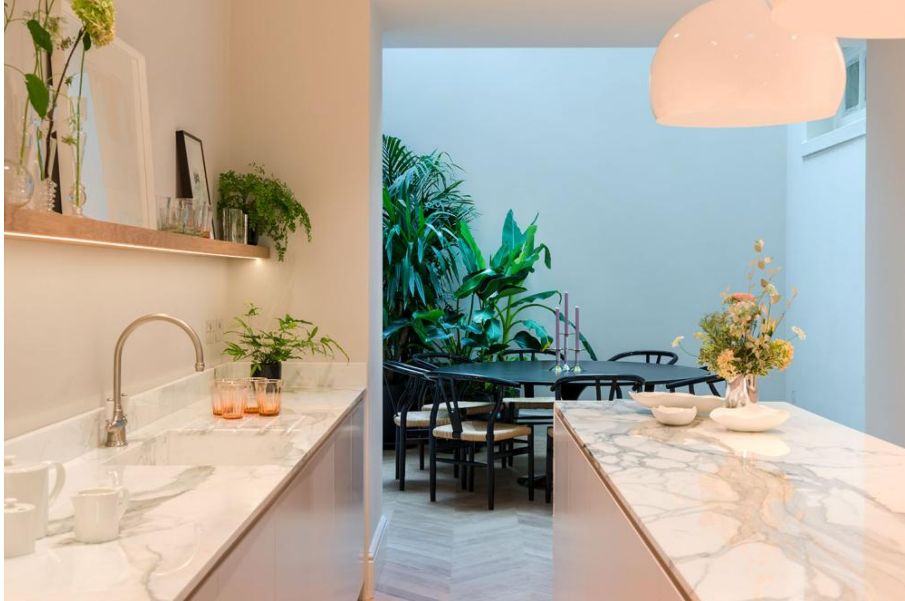
The owner's renovation features many open-plan spaces

The five-storey home is laid out over 4,725 sq ft, with five bedrooms — the master bedroom occupies the entire second floor — and five reception rooms. Each room presents a different hybrid of tones and fabrics, from marble tables to pastel-pink felt sofas, but the look is tasteful, not brash.