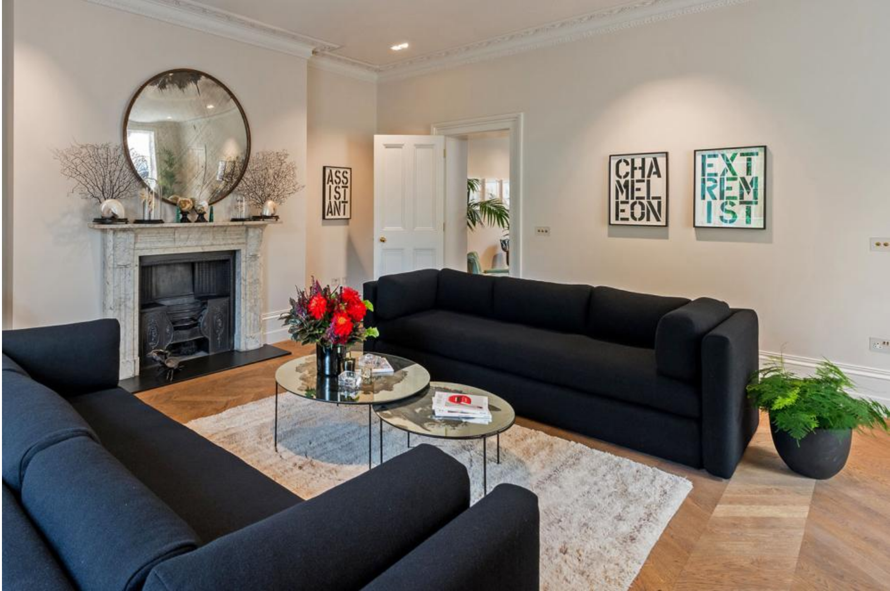
The home includes five reception rooms