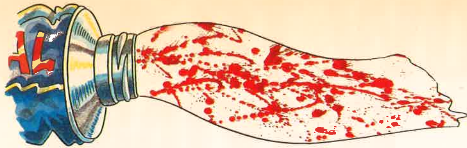
Signal, by Jackson Pollock's dentist