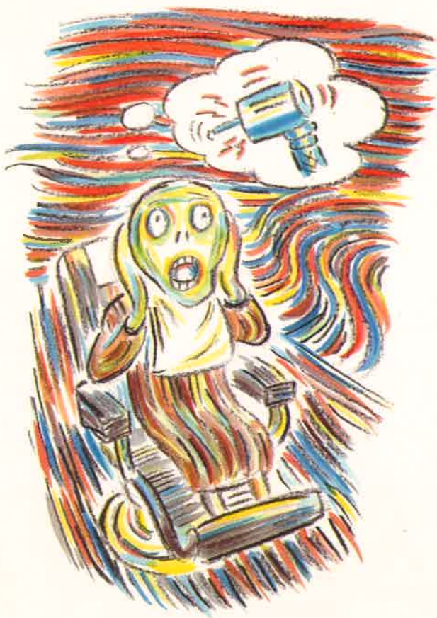
In The Chair, by Munch's dentist