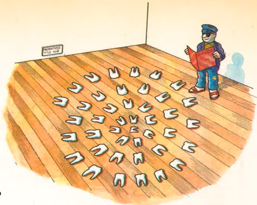
Teeth from the Tate