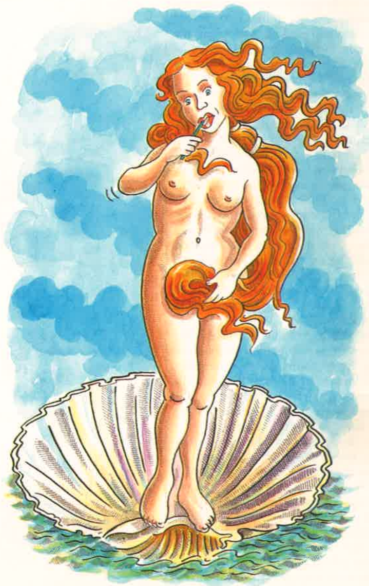
The Ultra-Brite Smile That Gets You Noticed, by Botticelli