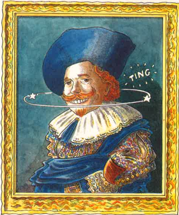
The Laughing Cavalier's Ring of Confidence